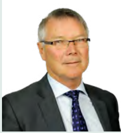
MINISTER FOR THE ENVIRONMENT HON DAVID PARKER