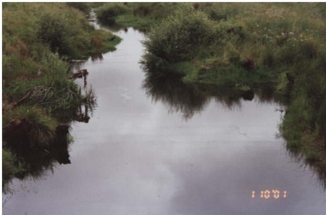
Figure 1: Example of an assessment site: Kakaunui Catchment

Application of the Cultural Health Index results in a score of A-0/ 2.56/ 1.06 (representing each of the three components).