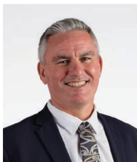
Hon David Parker Minister for the Environment

A handwritten signature in blue ink, appearing to read 'Kelvin Davis'.