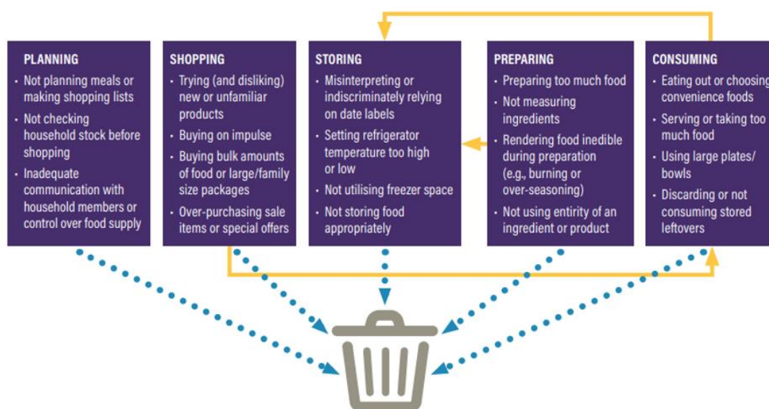
Figure 1: Key stages and behaviours

(Karunasena, Pearson, Nabi and Fight Food Waste CRC, 2020; Schanes, Dobernick and Gozet, 2018; We are what we do, n.d.).