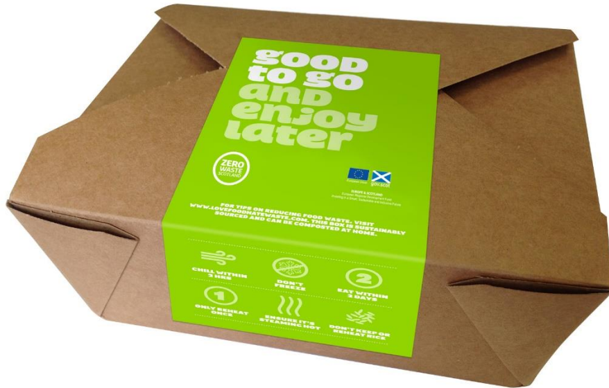
Figure 4: Scotland's good to go containers

are available for specific platforms. For instance, the Olio app has prevented 77,288 meals from being wasted (Frey et al, 2017), and in 2018, the ResQ Club helped to redistribute approximately 700,000 prepared meals, which equated to around 1,750,000 kilograms of CO 2 emissions (cited in Mattila, Mesiranta and Heikkinen, 2020).