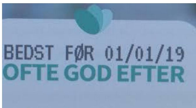
Figure 3: Danish labelling ‘best before often good after’

These initiatives straddle the boundary between ‘business food waste’ and ‘household food waste’; and they could be arguably placed in both categories.